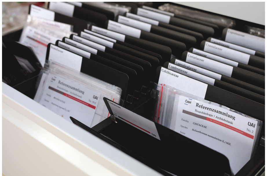
Figure 4. A look into the botanical reference collection.

with environmental data (see below). The spectrum of the research extends from the creation of individual biographies on the basis of anthropological assessment, to DNA and isotope (carbon, nitrogen, sulphur and strontium) analyses, and the intra- and inter-site comparisons with other central settlements in the ancient world. The comprehensive research strategy at Ephesus represents a key component of understanding the ways of lives of the inhabitants of Ephesus over time, there being three projects presently underway: the analyses of the topography of the necropoleis; tomb architecture and the treatment of the sarcophagi and ostotheke; and studies of nutrition, mobility and living conditions (Steskal et al. , 2015).